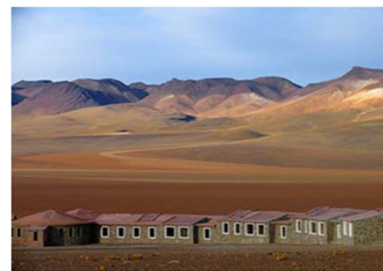
Hotel Takya del Desierto, Bolivia

ENJOY IT, EXPERIENCE IT! ENJOY IT, EXPERIENCE IT!