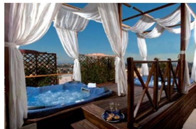
Grande Hotel Savoia, Genova, Italy