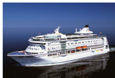
Birka Cruises, Stockholm, Sweden

ENJOY IT, EXPERIENCE IT! ENJOY IT, EXPERIENCE IT!