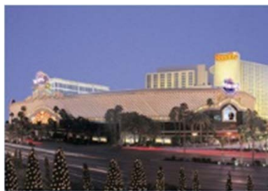
Harrah's Las Vegas, Nevada, US

→ Hotel Takya de Sal, Tahua – discover the largest salt desert of the world