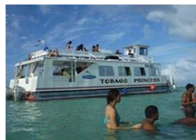
Paradise Tours Tobago, Trinidad & Tobago