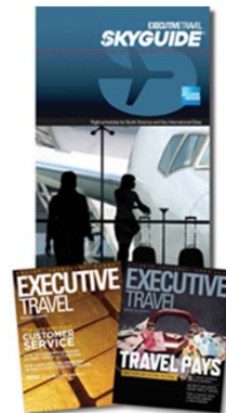
Executive Travel Sky Guide magazine

→ Green Path Transfer – 25% off on transfer service in all major cities worldwide