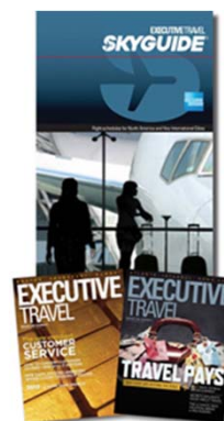
Executive Travel Sky Guide magazine

→ Green Path Transfer – 25% off on transfer service in all major cities worldwide